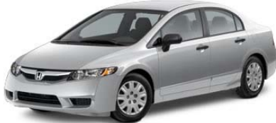
32 Miles per Gallon (MPG) EPA

Special Event Site: Benson Honda 9100 San Pedro San Antonio, TX 78216 www.bensonhonda.com For More Details Please Call: 866-576-0208